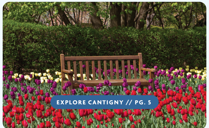
EXPLORE CANTIGNY // PG. 5