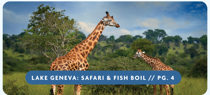
LAKE GENEVA: SAFARI & FISH BOIL // PG. 4